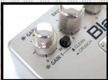
■ The HT-Dual has two channels, each with independent gain and level controls

FRESH, EXCITING PEDALS FROM A BIG NEW NAME IN AMPS AND EFFECTS