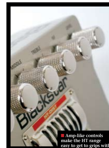
■ Amp-like controls make the HT range easy to get to grips with

a shiny paint job that recalls the 'champagne' finish that was popular with hi-fi manufacturers in the '70s, and are decorated with subtle yet effective black lettering. Apart from these pedals' sheer chunkiness, the main item of visual interest is the chromed grille that sits slap in the middle of each unit. A peek through the bars reveals these pedals' beating heart – an ECC83 (a.k.a. 12AX7) valve.