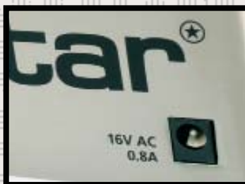
■ They don't take batteries, but a 16V AC mains adaptor is supplied with each pedal