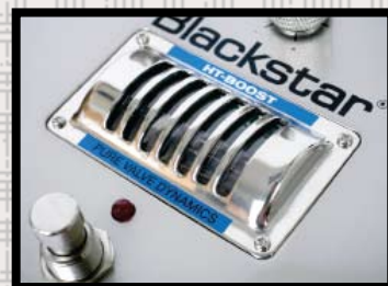
■ An ECC83 valve provides the oomph that makes these effects a little bit special